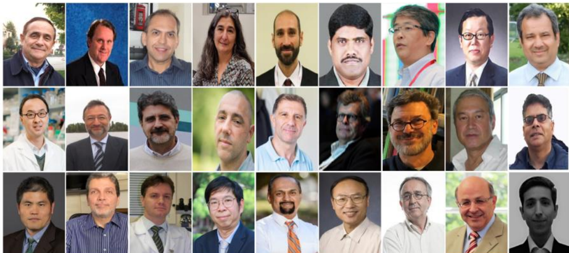
Figure 4. Associate Editors of EDS

Currently, EDS boasts an editorial board of 62 members from 24 countries, with 25 Associate Editors and 37 Editorial Board Members, collectively holding an average H-index of 45.5 . Over 37% of board members actively contributed through 2024 by