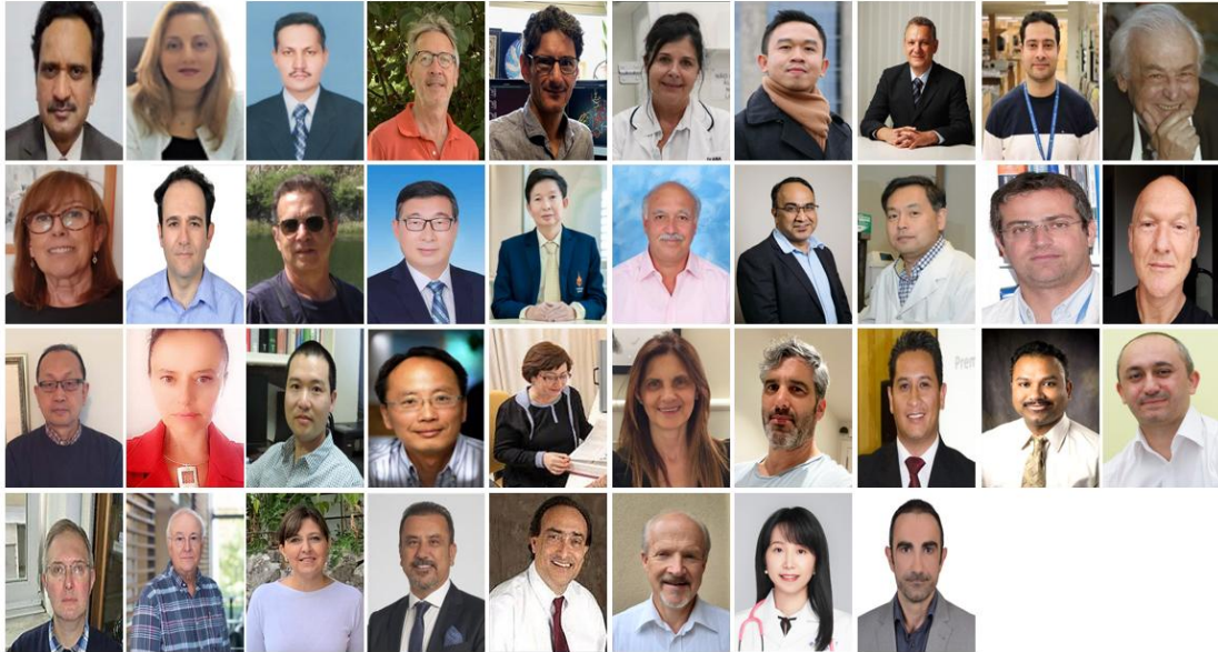
Figure 5. Editorial Board Members of EDS