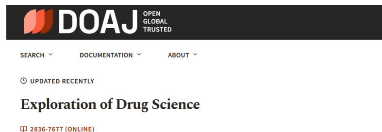
Figure 2. EDS indexed in DOAJ

EDS has been indexed in DOAJ, Google Scholar, and Dimensions and plans to apply for Scopus in March 2025, which requires a new journal to have two years of publishing history before application. We are confident in our application based on the experience of our other four sister journals.