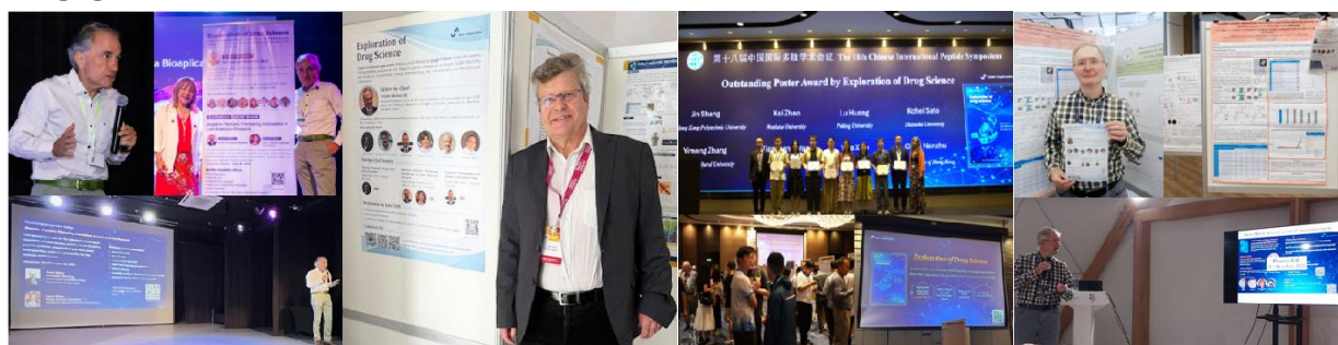
Figure 4. EDS in conferences- click here to view details

In 2024, EDS , with the strong support of our Editor-in-Chief and Editorial Board Members, actively participated in 4 international academic conferences , significantly boosting its global presence. These conferences provided crucial platforms for showcasing the journal, fostering collaborations, and broadening its academic impact. We extend our sincere appreciation to all members who played a role in these successful engagements.