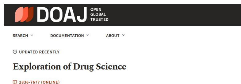
Figure 2. EDS indexed in DOAJ

EDS has been indexed in DOAJ, Google Scholar, and Dimensions and plans to apply for Scopus in March 2025, which requires a new journal to have two years of publishing history before application. We are confident in our application based on the experience of our other four sister journals.